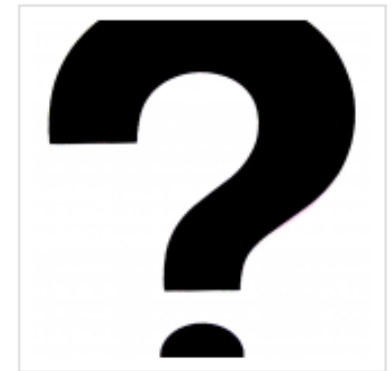
Donate Other Item: