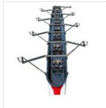
New 8+ Price: $27,000