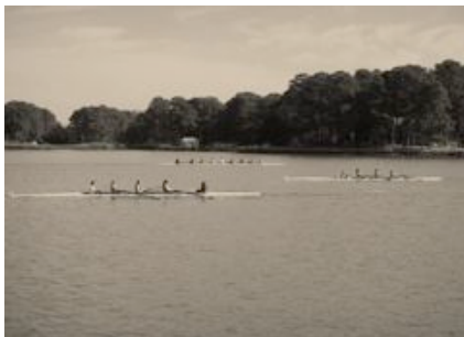
The Novice Women's 4+ passes another boat.