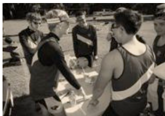
The Novice feast on bagels after racing.

place finish of the day. They continued their success with a second-place finish in the Women's Collegiate 8+, rowing 21:01 for the distance. Finally, the novice men's 4+ boats finished 2 nd and 3 rd in their race with respective times of 20:36, and 22:24. Overall, the team rowed very well and gained experience that would help them at the next two weekend's regattas: Head of the Hooch and Head of the South.