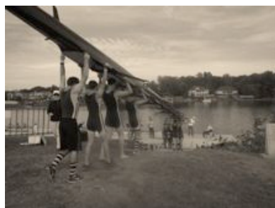
Varsity Men's 8+ at HoTS.