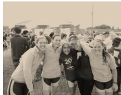
The Women's Club 4+ reacts to their win at Head of the South.

The fall season has had its fill of challenges, rewards, mistakes, corrections, losses and victories. At the beginning of every season, novice rowers from the previous year move up and join their fellow teammates in the rank of Varsity. The women's squad at William & Mary was no different; with a new batch of rowers moving from novice to varsity, the squad nearly doubled in size! And after a couple weeks of practices and getting back into rowing shape, the new varsity girls started to find their place with in the squad, helping the team grow in strength. Due to some complications this year, the Head of the Charles was our first race. However, the varsity women were able to find a way to overcome this challenge, and had a great performance. They had a strong race and finished just .9 sec off an automatic bid next year, and I believe next year we can break that barrier. The next race was the Head of the Hooch, and with some late lineup switches we didn't finish as well as we were hoping. However, by the time the Head of the South came around, we were ready to rock and roll. We were able to pull off a bronze medal in the Women's 8+ event and the real surprise was our Women's club 4+ grabbed Gold in their event. Congrats, girls... and enjoy the donuts! Let's get excited for the spring!