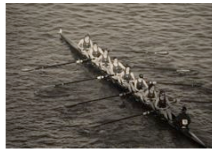
The Women's 8+ races at Head of the Hooch.